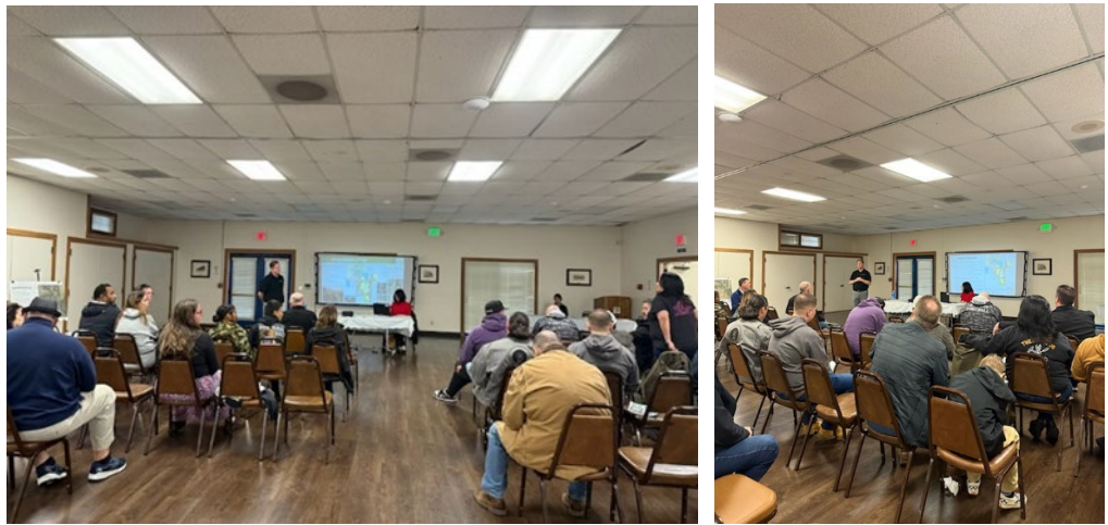
Above: Project team presenting the project to the community.